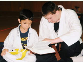
Making An Eternal Difference, One Black Belt At A Time