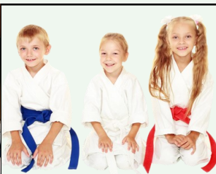
It Is Easier To Build A Child Than To Repair An Adult.