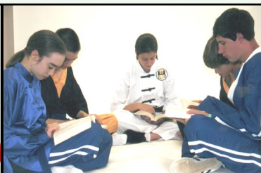
Prayer and Bible Lessons Are A Part of Every Class Session.